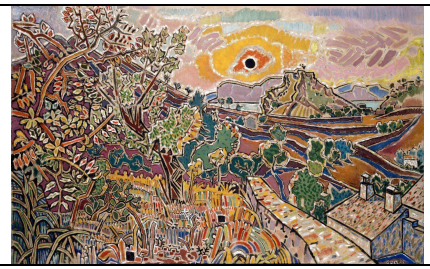
2. The Black Sun Nikos Hadjikyriakos