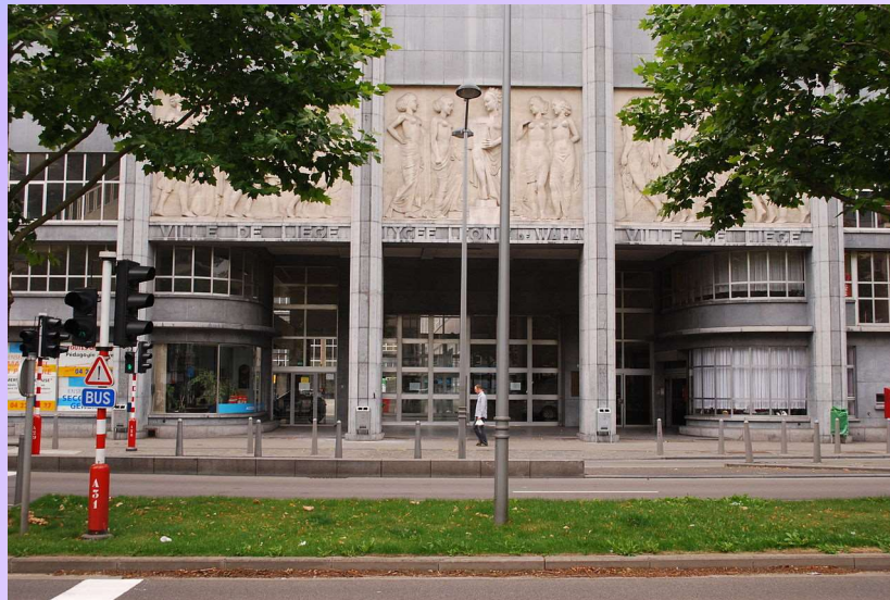
Lycée de Waha/Liège